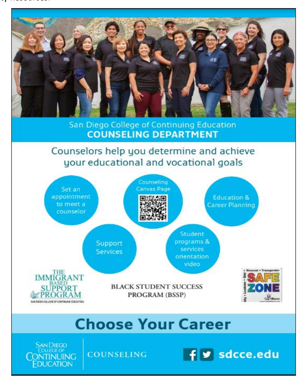
Events & Resources for Professionals

Applications - Guide students with Graduation Requirements - Referral to on/off-campus and community Resources.