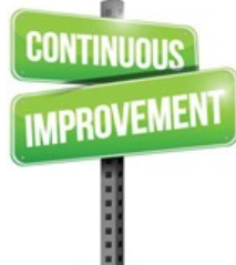
SLO Assessment Cycle Results