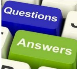
SLO Assessment Week '22