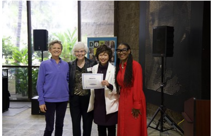
Emeritus Wins Silver

The SLO Committee proudly congratulates the Child Development and Emeritus programs as the 2025 Gold and Silver Top Program Participation Award Winners for their outstanding commitment to the assessment of Student Learning Outcomes (SLOs). Your efforts ensure we continue to grow a culture of meaningful learning and improvement. Thank you for leading the way! Your dedication supports our mission of equity, access, and student success. Proudly include your gold or silver insignia in your email signature!