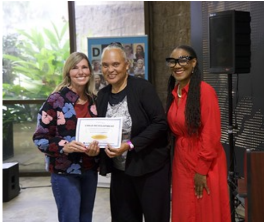
Child Development Wins Gold