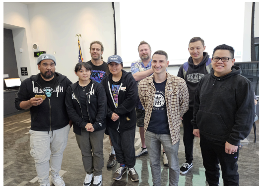
San Diego College of Continuing Education's Cyber Security Competition Team